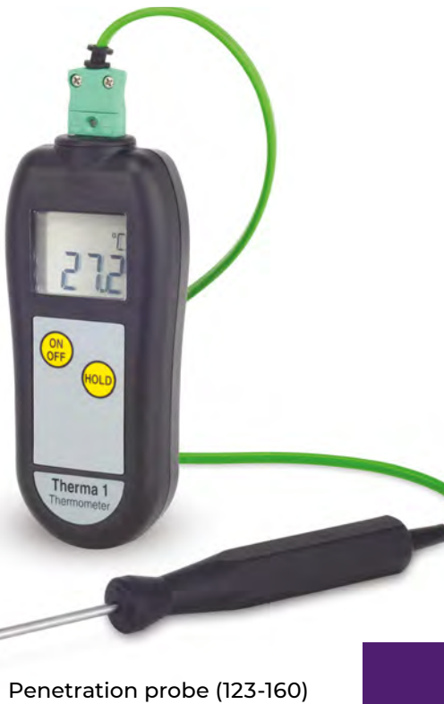
Penetration probe (123-160)